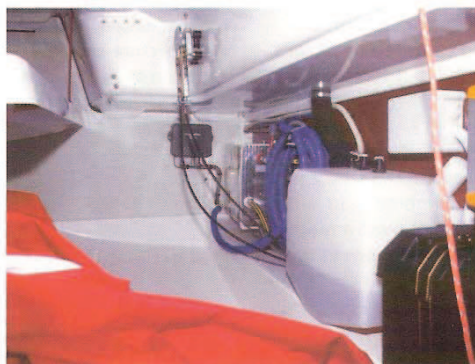
Above and left Down below the A35 is quite basic – there is a utility area with a pipecot, plus access to the batteries – and could feel cluttered with full racing crew and sails onboard.

Upwind, even in light winds, it accelerated well from standing and out of the tacks. Though we had no gauge it felt close-winded, holding her height and speed well, and seemed quite stiff.